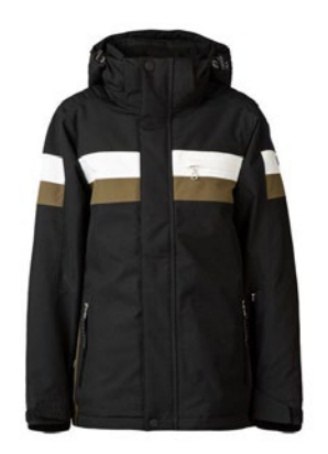
Black - 08