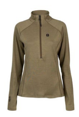
Beech - 79