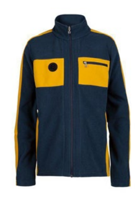
Navy - 15