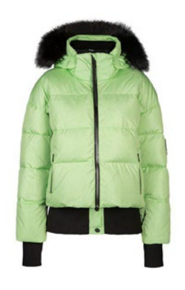
Black - 08