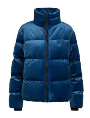
Black - 08