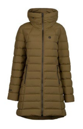
Black - 08