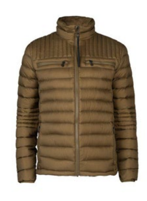
Black - 08