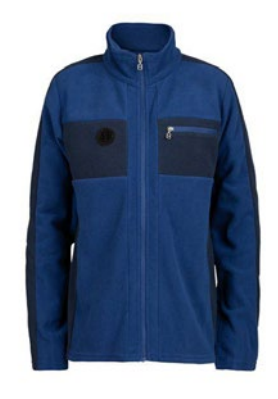
Peony - 30