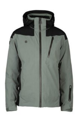
Griffin - 55