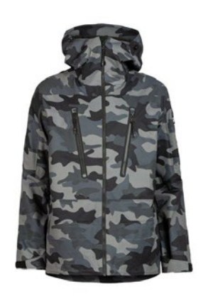
Camo - M3