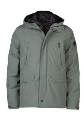
Griffin - 55