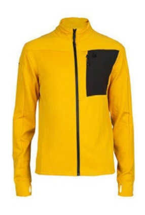
Mustard - 12