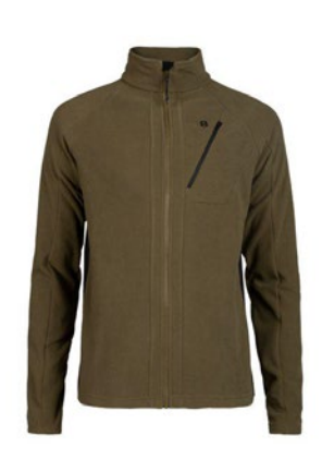
Blue - 33