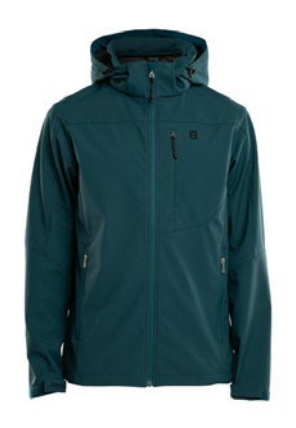
Indigo - 94 Reflecting Pond - B9