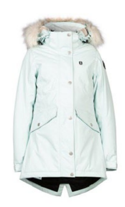
Ciel - 57