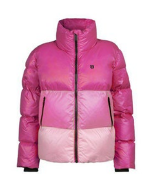
Pink - 35