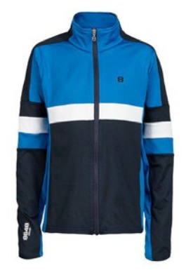
Black - 08