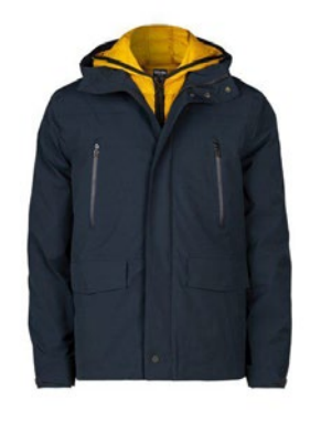
Navy - 15