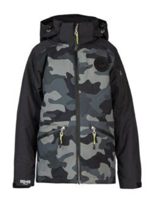
Camo - M3