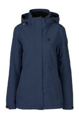
Navy - 15