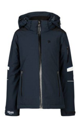
Navy - 15