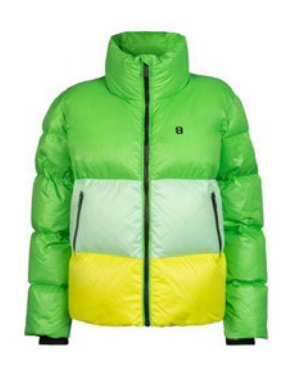
Green - 34