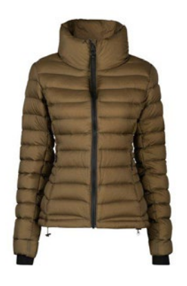
Beech - 79