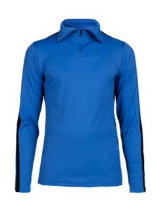
Blue - 33