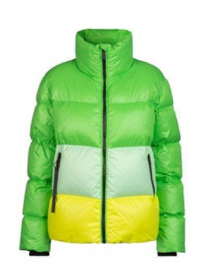
Black - 08