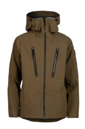
Beech - 79