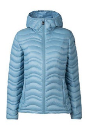
Blue Shadow - 73