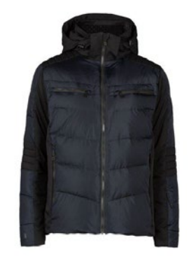
Black - 08