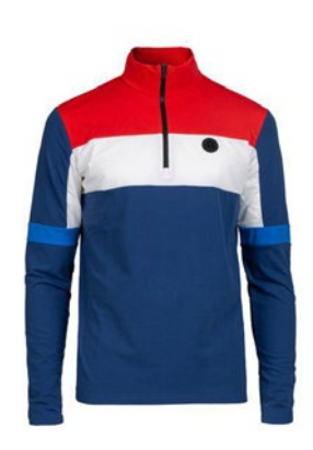
Blanc - 02