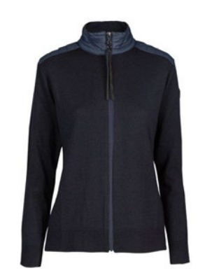
Blanc - 02