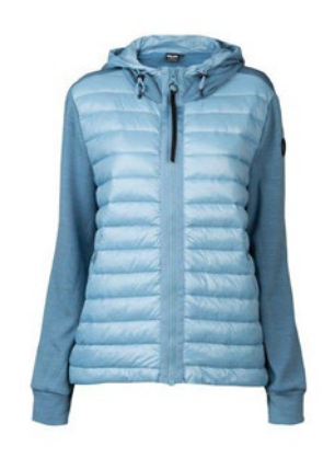
Black - 08