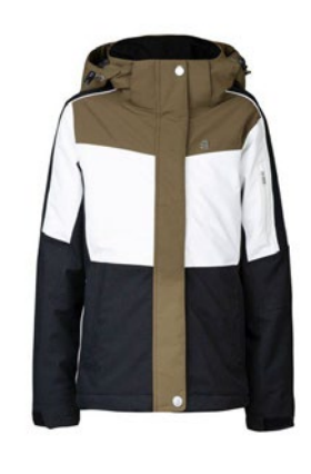
Red - 03 Pink - 35 Peony - 30 Beech - 79