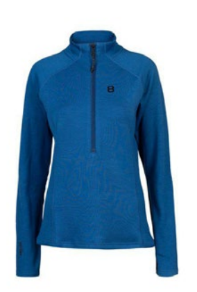
Peony - 30