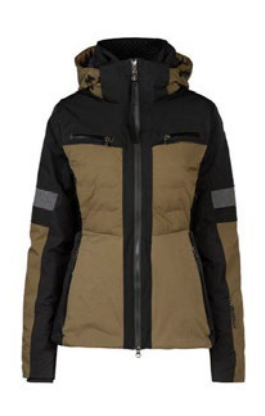
Black - 08