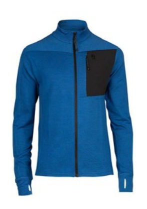
Peony - 30