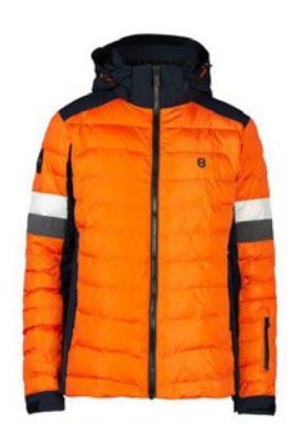
Peony - 30