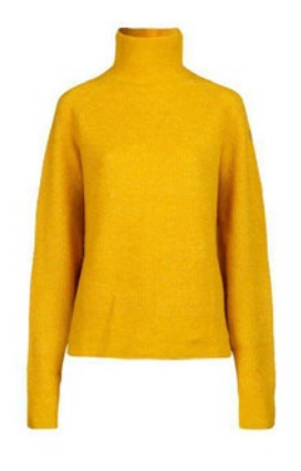
Blanc - 02