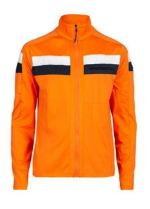
Peony - 30