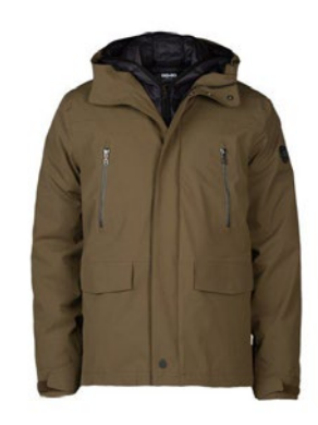
Beech - 79