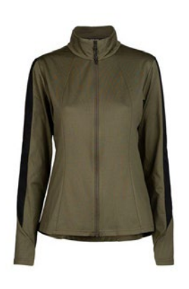
Turtle - 39