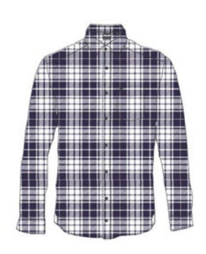
Peony - 30