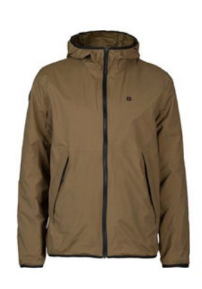
Black - 08