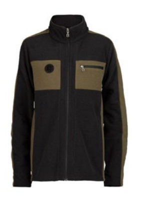
Black - 08