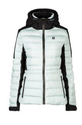
Navy - 15 Ciel - 57