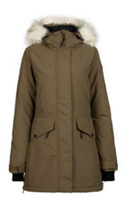
Beech - 79