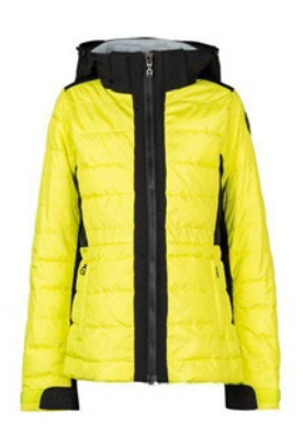
Lime - 83