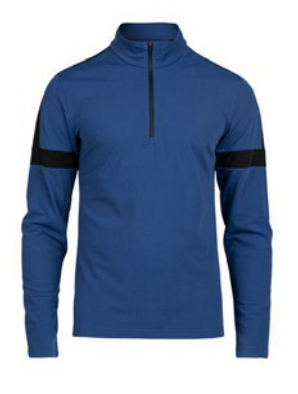
Navy - 15