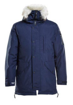
Navy - 15