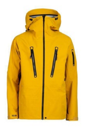
Mustard - 12