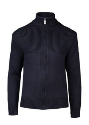
Navy - 15