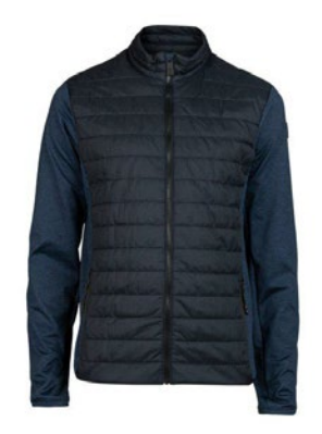
Black - 08