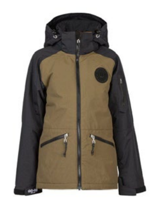
Mustard - 12 Peony - 30 Beech - 79