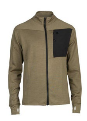
Beech - 79