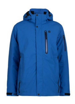
Blue - 33