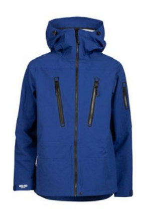
Peony - 30