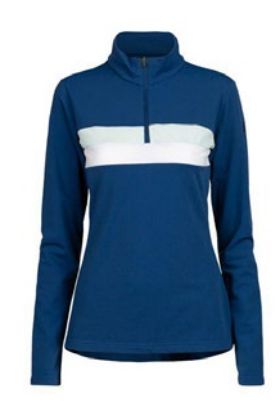
Blanc = 02 Red = 03 Black = 08 Peony = 30