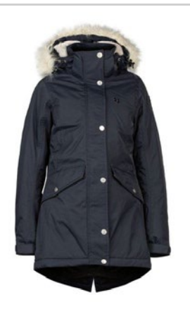
Navy - 15