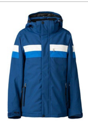
Peony - 30