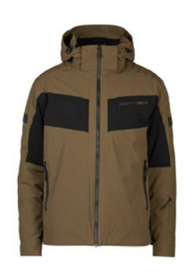
Blanc - 02