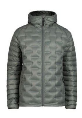
Griffin - 55