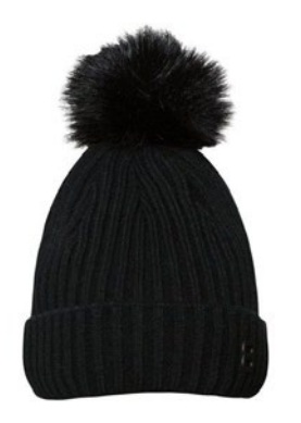
Blanc - 02