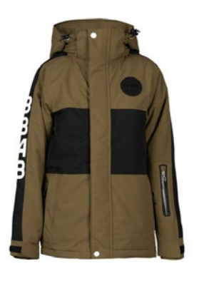
Beech - 79

Griffin - 55 Mustard - 12 Navy - 15 Blue - 33