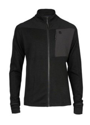
Black - 08