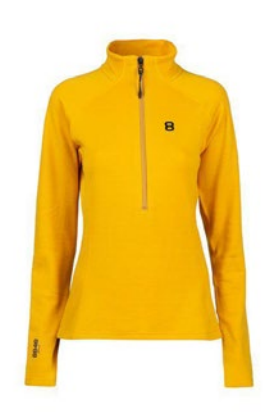
Mustard - 12