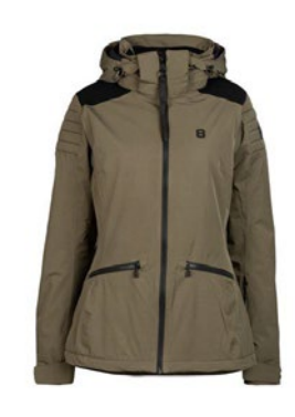
Red - 03 Black - 08