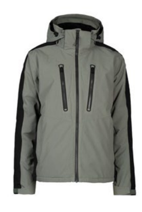
Mustard - 12 Navy - 15 Griffin - 55 Peony - 30