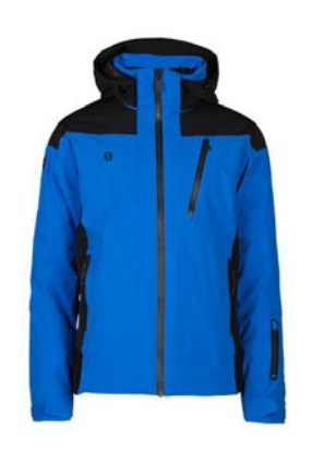
Blue - 33