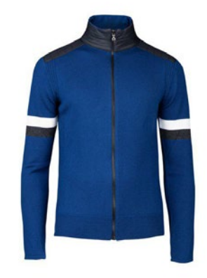
Black - 08